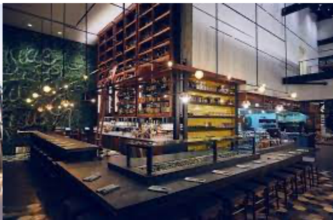
[EaterLA; Wine & Spirits]